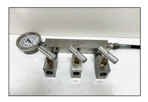
With pressure gauge, inlet pressure hose and 3 output Pressure Needle valves