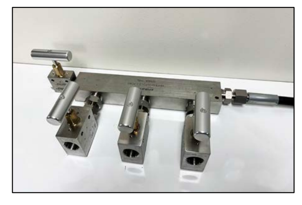
With inlet pressure hose, pressure bleed valve on side and 3 output Pressure Needle valves

Customized according to your requirements and aggregations such as hoses, valves, gages, PSV valves, sensors, quick disconnectors, digitalized pressure recorders and more available